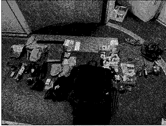
(U//LES) Figure 1: Tactical military gear found during baggage examination

SUB1 stated that he was flying into Warsaw, Poland, to connect with three members of the French Foreign Legion, who are currently in Krakow, Poland. SUB1 stated he intends to hitch a ride to Lviv, Ukraine, and will attempt to apply for recruitment via a recruitment center and will be working with a local militia group, who will provide him with weapons. Open-source information indicated SUB1 was a reported Boogaloo movement 9 leader in Virginia. When questioned about his involvement with the Boogaloo movement, SUB1 stated he had not been involved with the group for almost a year due to the direction they were heading in. A search of SUB1's checked, and carry-on baggage revealed multiple first aid items (gauze, pain killers,