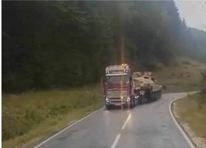
Avia Pro: American tanks seen near the border with Ukraine.

The US has begun moving its heavy tanks and light armored vehicles to the border with Ukraine, apparently preparing to use these vehicles to attack Russia. How exactly the tanks and other armored vehicles of the US Armed Forces got into the territory of Romania is unknown, however, it is alleged that the equipment is being transferred towards the Ukrainian border very intensively.